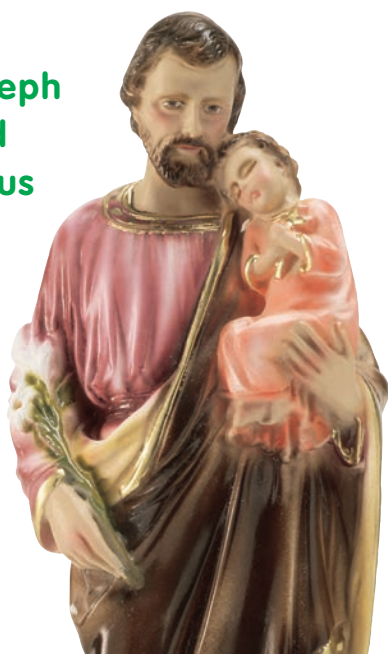
Joseph and Jesus

Joseph the foster father of Jesus, who was engaged to Mary when the angel announced that Mary would have a child through the power of the Holy Spirit